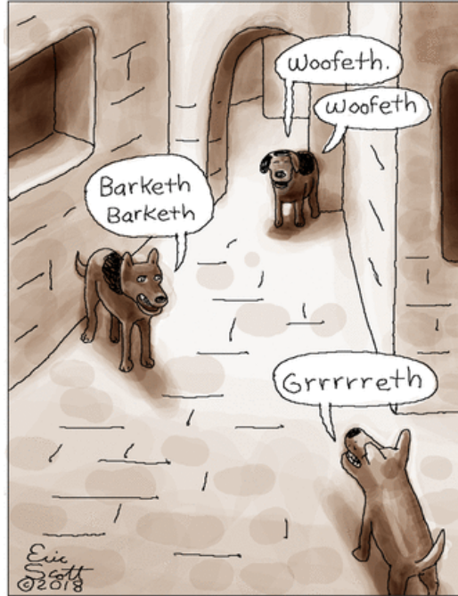
Dogs of the Bible.